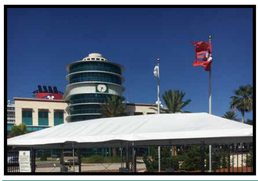
Ohenry 15' x 40' Frame Tent