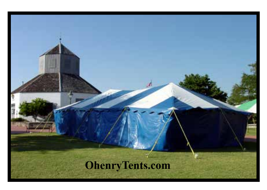
Ohenry 20' x 40' Pole Tent