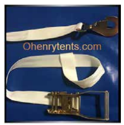
2" and 1" Ratchet Straps