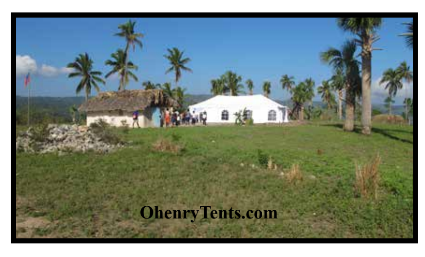
Ohenry 20' x 40' Pole Tent