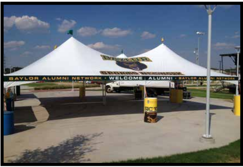
Ohenry 20' x 40' Frame Tent