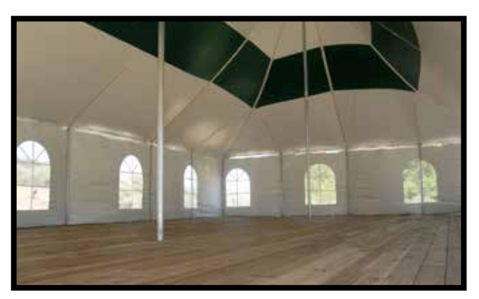
Cathedral Window Walls are available in square top or rounded top