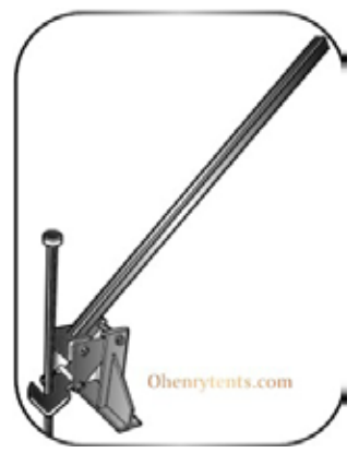
Large Stake Puller