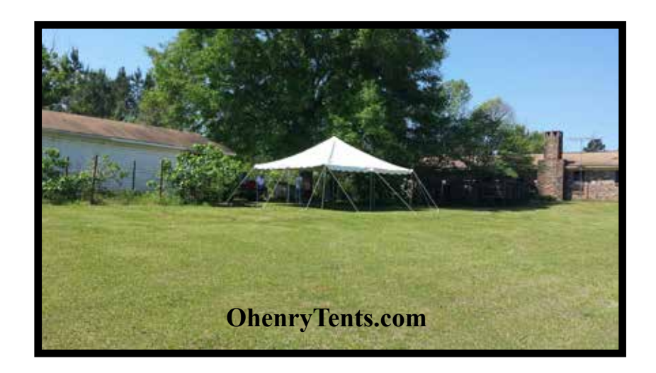
Ohenry 20' x 20' Pole Tent