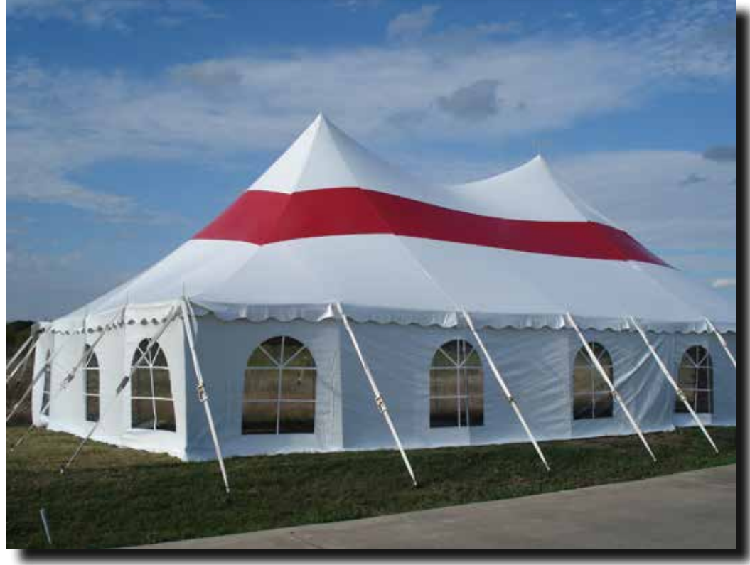
Mystique 30x50 Exterior