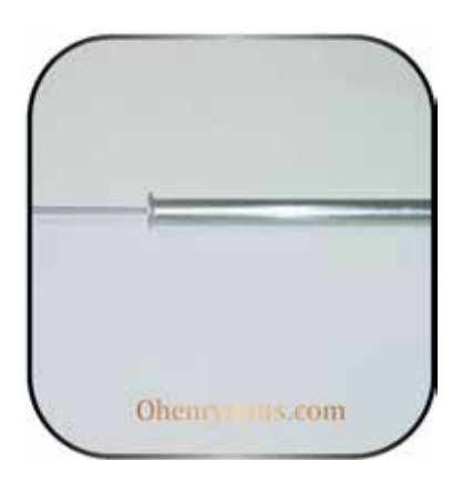
Galvanized Side Poles and Center Poles