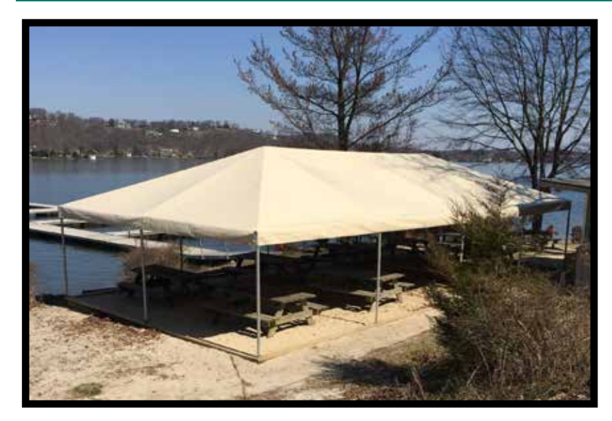
Ohenry 20' x 40' Frame Tent