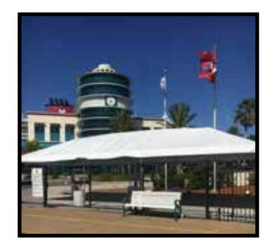
15'x40' Frame Tent

A pole tent is much more portable than a frame tent. Pole tents are MUCH easier to install than a frame tent.