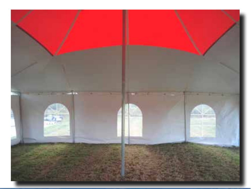
Mystique 30x50 interior

With their sweeping lines and curves Ohenry's "Mystique" High Peak tents give your party or wedding the elegant look to turn your event from the ordinary into the exceptional!