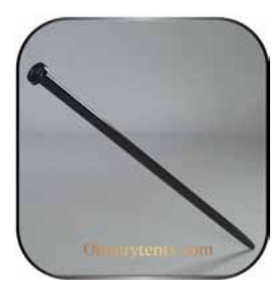
Forged Tent Stakes